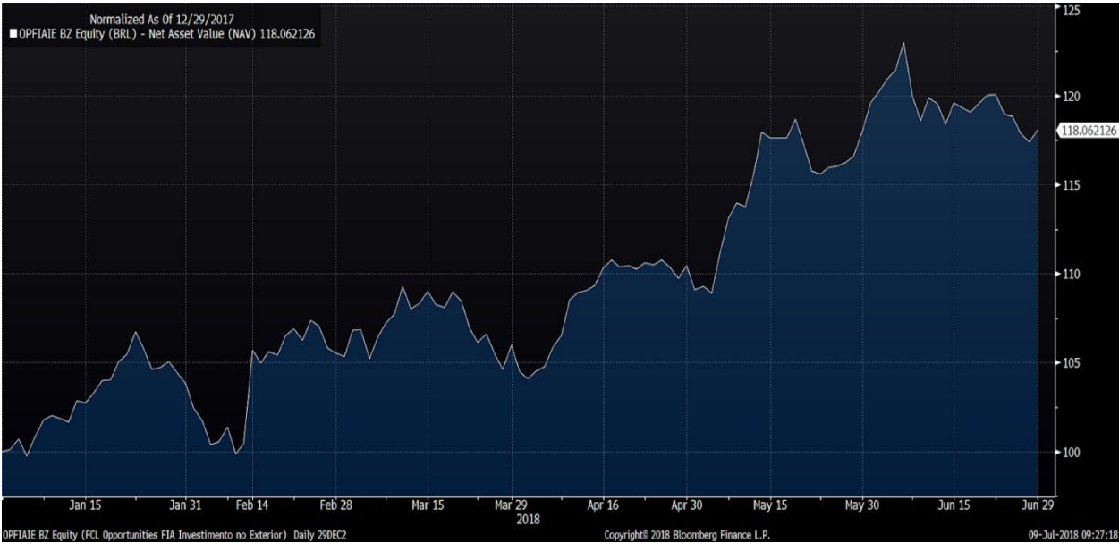
Fcl Opportunities in $BRL, YTD: + 18,06%