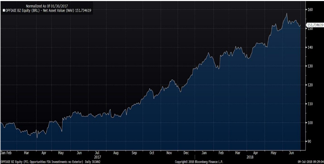
FCL opportunities since inception, in $ BRL: + 51,73%