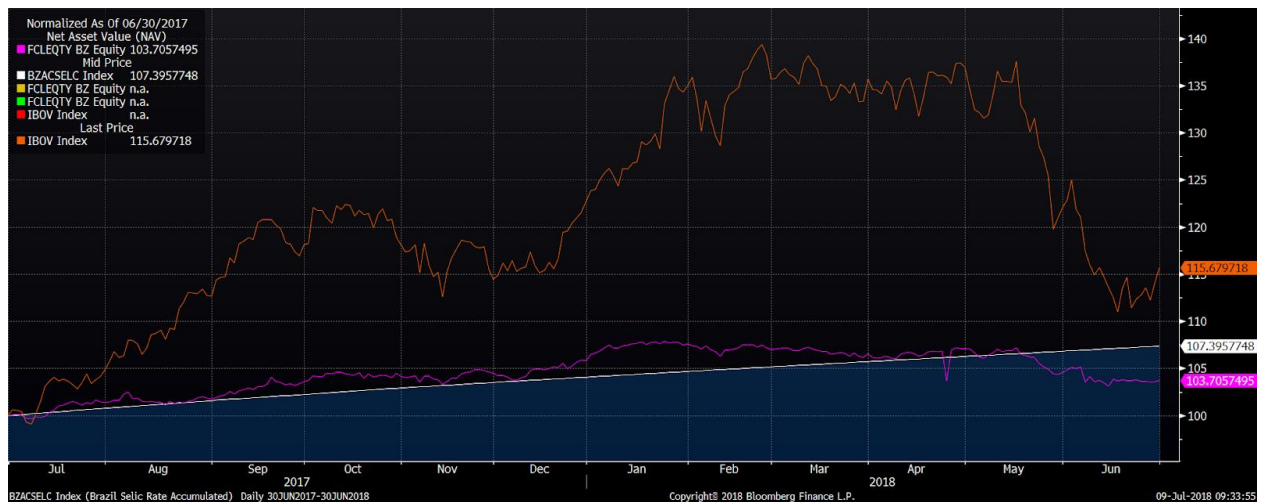
Ibovespa (red), Brazil CDI (white), FCL Hedge (purple), last 12 months