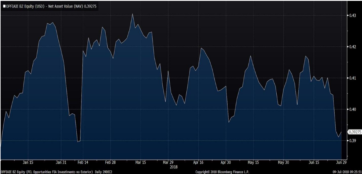
FCL Opportunities in USD, YTD: + 1,21%